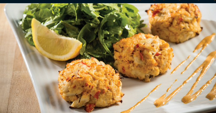
JUMBO LUMP CRAB CAKES

Broiled housemade jumbo lump cakes, our aioli - 21.95