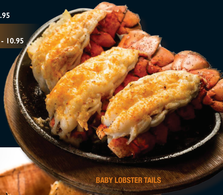
BABY LOBSTER TAILS