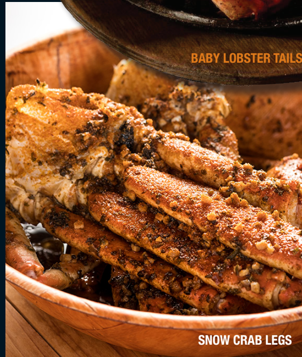
SNOW CRAB LEGS