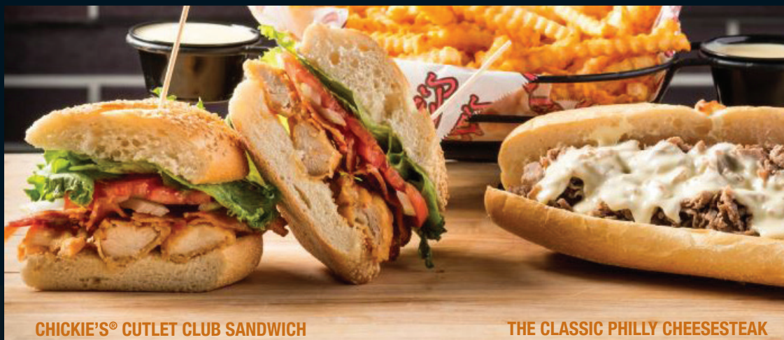
CHICKIE'S® CUTLET CLUB SANDWICH

Mozzarella & Romano cheeses, our famous red sauce - 9.95