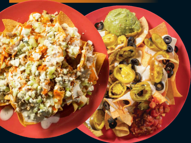
BUFFALO CHICKEN NACHOS