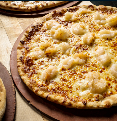
LISA'S BLONDE LOBSTER PIE™

3.00 toppings: beef steak meat | chicken steak meat | bacon